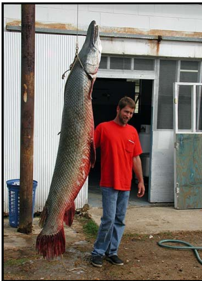
This large alligator gar was just under 8 feet in length and weighed 215 pounds!