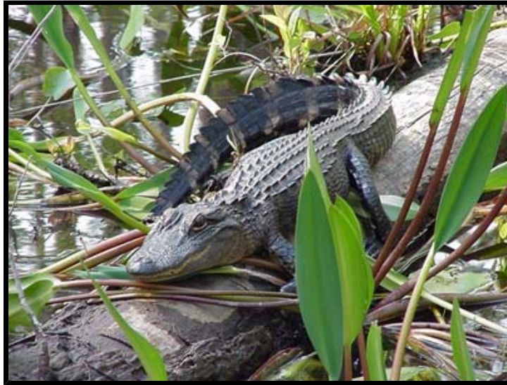
American alligators are a potential predator of alligator gar

Little is known of the life history of alligator gar. The gonadosomatic index for mature males and females, and female reproductive hormone analysis have indicated that spawning occurs in late spring, young specimens collected have indicated that spawning probably occurs in April, May, and June in the southern United States. Alligator gars are thought to spawn in the spring by congregating in large numbers with a female and one or more males on either side to fertilize the eggs. Fecundity in females has a positive correlation with total length. Females generally carry an average of 138,000 eggs. The eggs are released and fertilized by the male outside of the body they sink to the bottom after being released and stick to the substrate due to an adhesive outer covering. The eggs are bright red and poisonous if eaten. Alligator gars are thought to spawn in the floodplain of these large rivers, giving their young protection from predators.