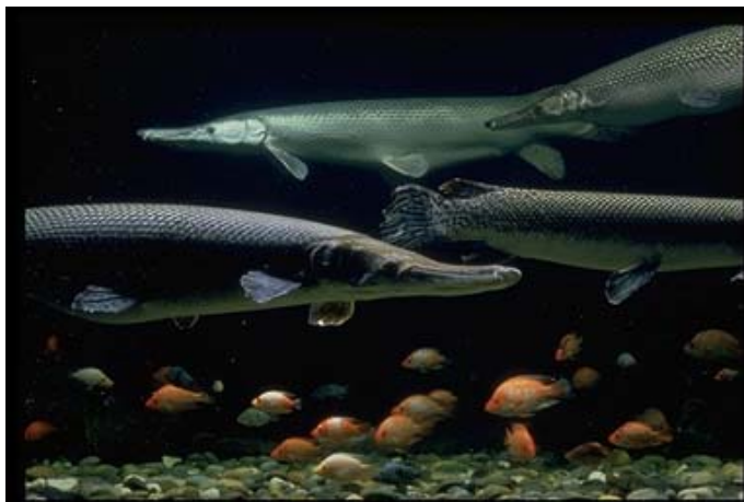
Alligator gars in an aquarium